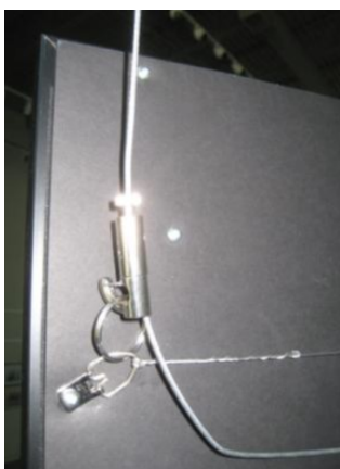
Medium 3/4" eyelet with split ring